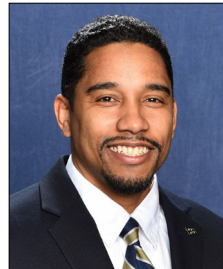
Archie Collins Secondary