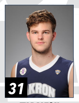
Fr. • Guard • 6-4 • 200 Houston, Texas South Kent School