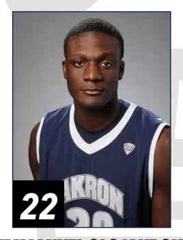
r-Fr • Forward • 6-8 • 190 Houston, Texas Cypress Springs HS